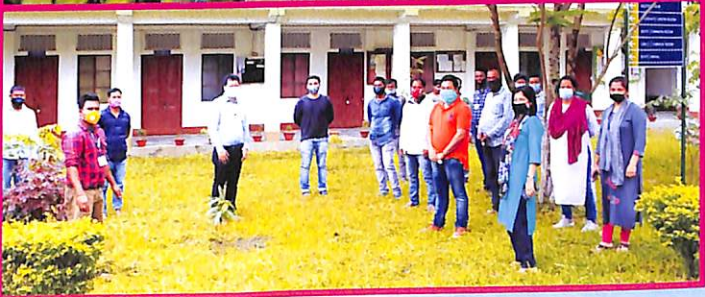
World Environment Day Celebration on 5 th June, 2020