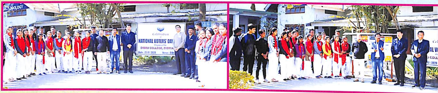
National Voters' Day Celebration on 25 th January, 2020