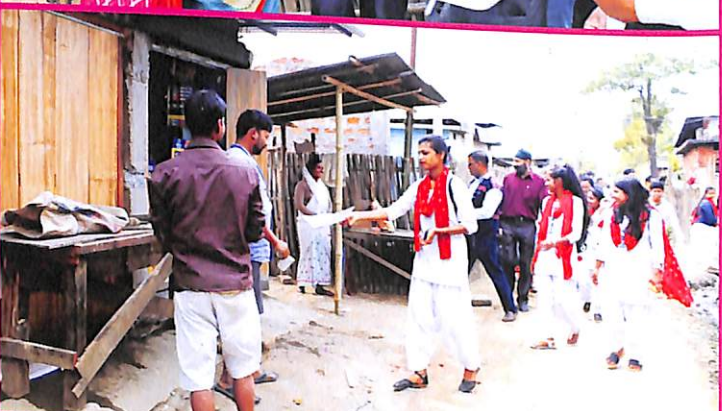
Awareness Programme on the use of COVID -19 Protocols in Neighbouring Areas of Dibru College