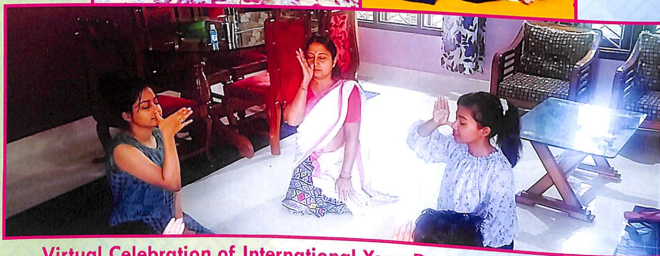
Virtual Celebration of International Yoga Day on 21 st June, 2020

Newsletter Concept : IQAC, Dibru College, Dibrugarh Layout, Design & Print : Brahmaputra Offset, T.K. Das Lane, Khalihamari, Dibrugarh-1, Cont. No. : +91 99544 84710 Published by : Dibru College, Dibrugarh